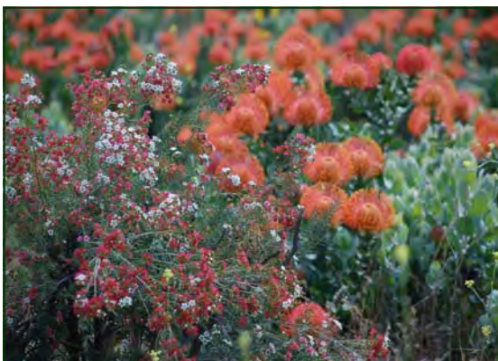
Waxflower Sweet 16 and Pincushion Flame Giant