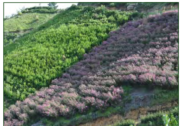
Waxflower and Leucadendron Fields