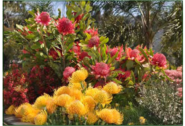
Telopea, Pincushion and Fillers